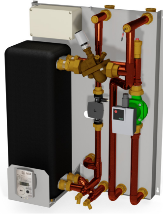
Single Zone CH + Direct Primary Feed