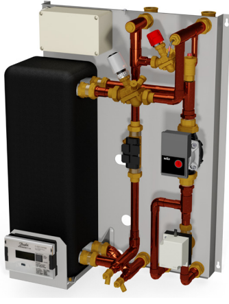
Single Zone CH + Un-Valved Feed