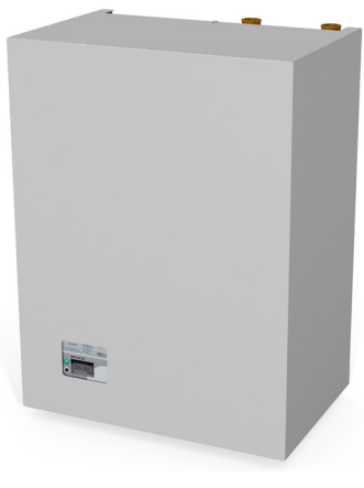
MAJOR and MASTER Case