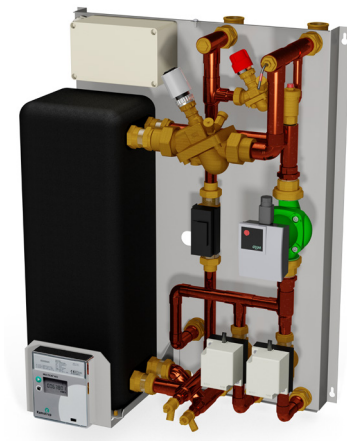
Dual Zone CH + Indirect Cylinder Feed