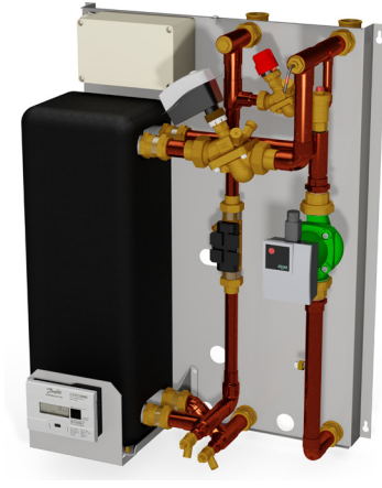
Electronic CH Temperature Control