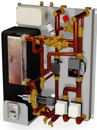
Dual Zone CH & Instant DHW