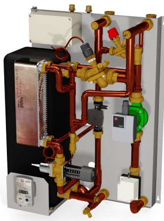
Single Zone CH + Instant DHW