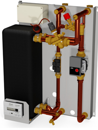
Mechanical Return Temperature Limitation